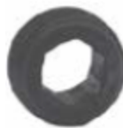
Lock Screw UP-035-1