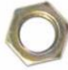
Body Stud Nut 3/4" NF UP-024-1