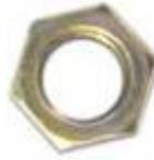
Body Stud Nut 5/8" NF UP-021-1